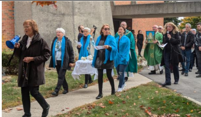
Last weeks procession with our Blessed Mother